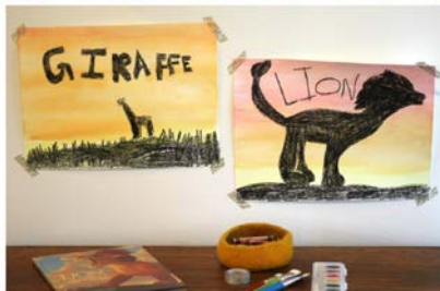
ANIMALS OF THE PRIDE LANDS