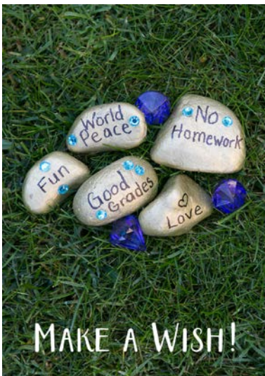
MAKE A WISH!