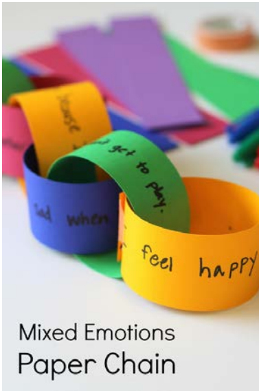
Mixed Emotions Paper Chain