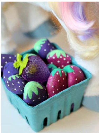
FOR UNICORNS ONLY! SUGARBERRY TREATS Rock-Painting Craft