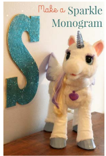
Make a Sparkle Monogram